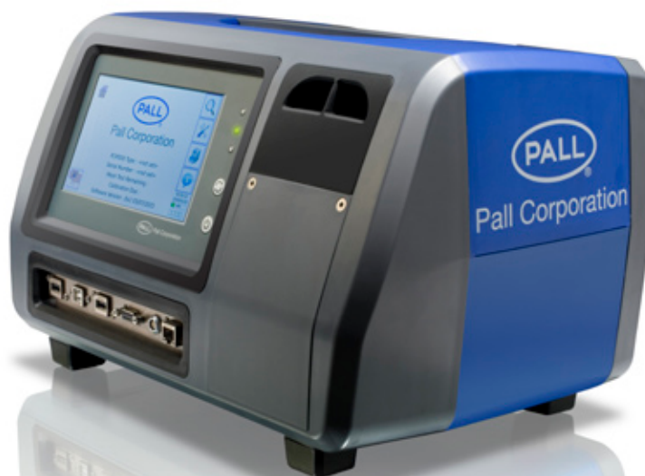
PCM500 Fluid Cleanliness Monitor

*3 part code measured at 4 \mu m, 6 \mu m and 14 \mu m (c) per ISO 16889.