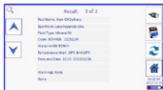
Multiple test data can be stored and displayed for subsequent analysis and download