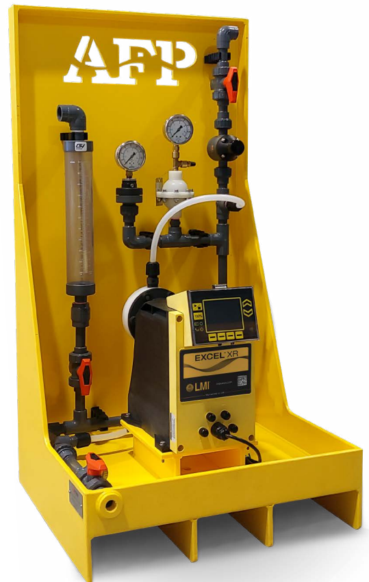
DOSU-S Single pump design